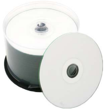
Free inkjet printable media

CD media with CD towers CD & DVD media with DVD towers