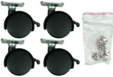
Wheels and Hardware

CD media with CD towers CD & DVD media with DVD towers