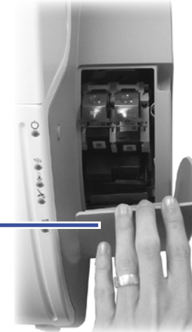
Ink Cartridge Access Door