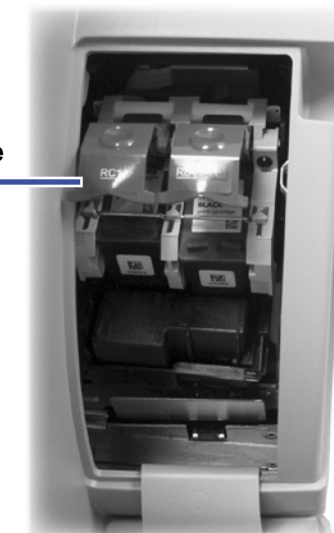
Ink cartridge latch